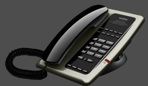
SmartStation Gloss Silver / Black Handset